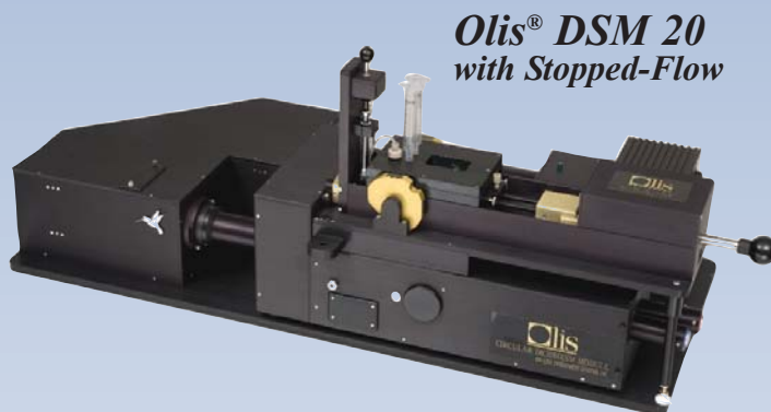
Olis® DSM 20 with Stopped-Flow

Computer, LCD, electronics, power supply, and lamp cooling box can be oriented as shown here, spanning a comfortable 1.5 meter range, or these components can be mounted above or below bench level.