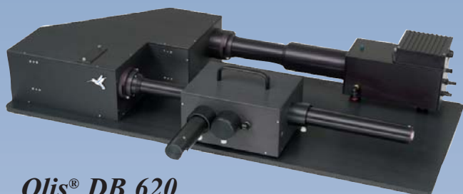
Olis® DB 620 for absorbance

Our new double grating monochromator with accessible gratings and detectors for UV, Vis, and NIR. All-new Olis® absorbance and CD spectrophotometers are now available; fluorescence models are under development.