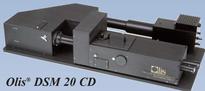
Olis® DSM 20 CD